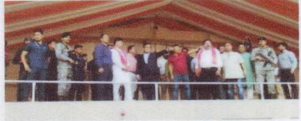
ডিব্ৰুগড়, ২৪ এপ্ৰিলঃ অডিচ কালি আংলং জিলাৰ সদৰ চহৰ ডিব্ৰুগড় পাছৰ মেজমেল সংকৰ ৩৩ৰত এমআইচিই প্ৰশিক্ষণ কেন্দ্ৰত এশ শতাংশ ক'ভিড ভেকচিনেশ্যন আৰু নিয়মীয়া উল্লেখকৰ সন্দৰ্ভত এখনি সজাগতা সভা অনুষ্ঠিত হয়। ইন্টিগেছন আৰু ভাৰতৰ ক্ষেত্ৰমূলক স্বাস্থ্য আৰু ডিব্ৰু জায়নাৰ